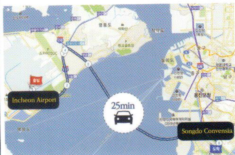
Direction to the venue from Incheon Airport

Address: 123 Central Street, Yeonsu-gu, Incheon Tel. +82-32-210-1114